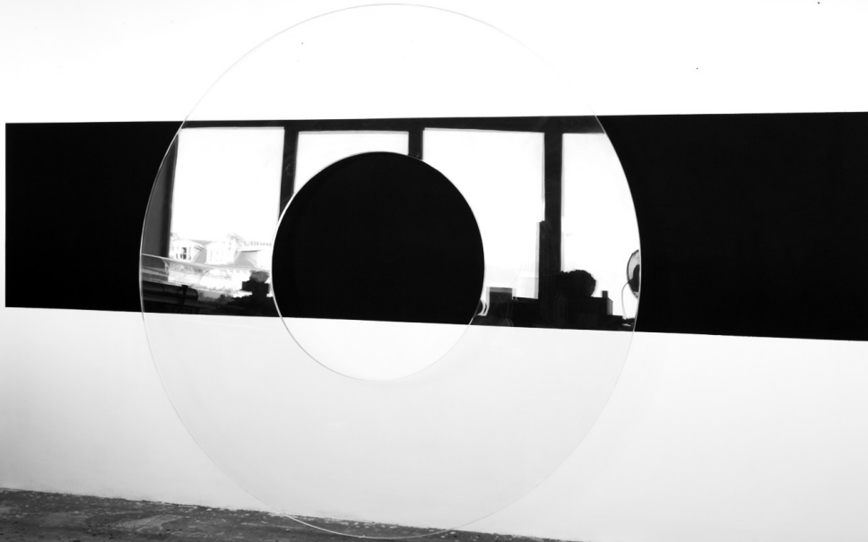
Lapsus VIII, 2010 | Perspex circle, 180 cm diameter x 1.5 cm | Wall painting

Miquel Mont was one of the artists who came to Josep Suñol's attention in the early 1990s, when the collector was particularly interested in emerging artists working outside the official art circuits. It didn't take long for Mont's work—with its focus on the analytic side to painting—to join the collection.