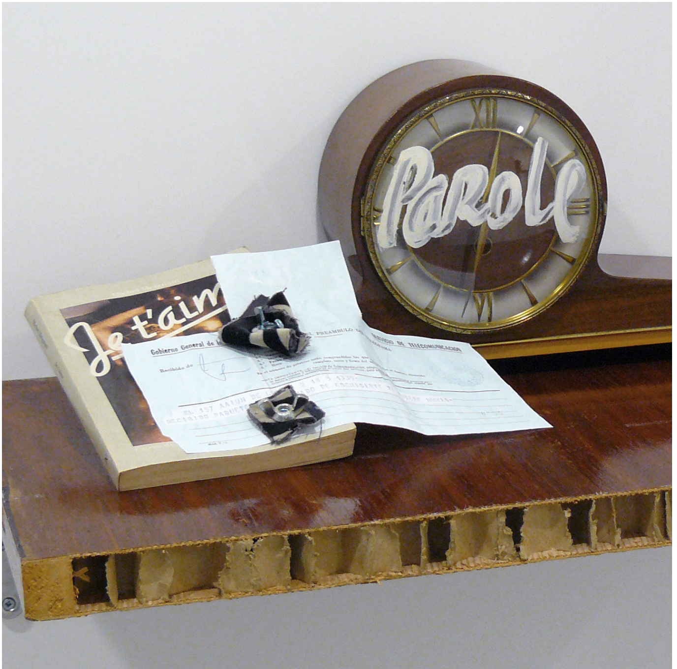
CARLOS PAZOS | Parole, parole | 1991

A book, a shoe, sunglasses – these are functional objects from daily life we are all familiar with. Yet what effect do they have on us when we find them out of context? What new meaning do they take on when they are presented in an unusual, unexpected way?